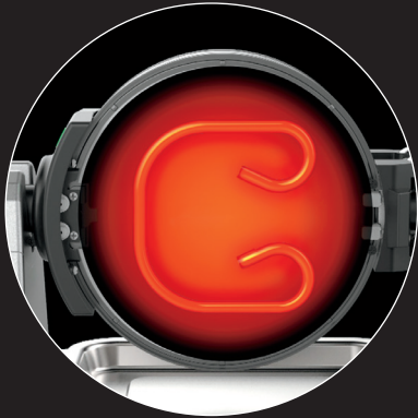
Embedded Heating Element For Precise Temperature Control