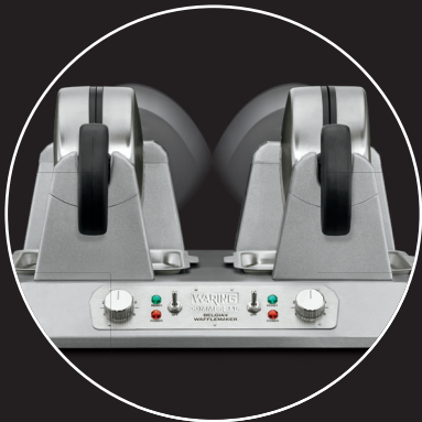
Rotary Feature For Even Baking And Browning