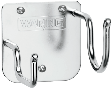
WSB01 Wall Hanger for Immersion Blenders