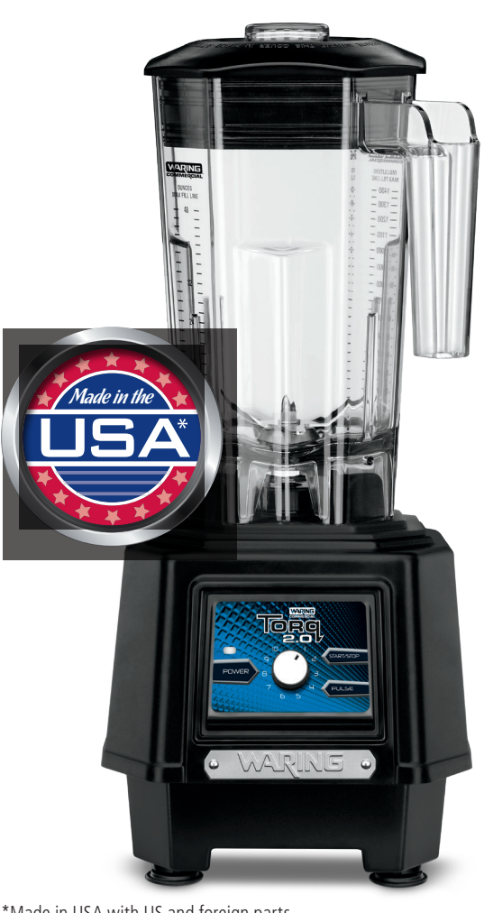
*Made in USA with US and foreign parts.