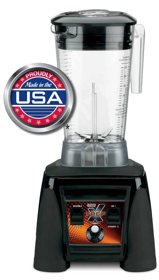
*Made in USA with US and foreign parts.